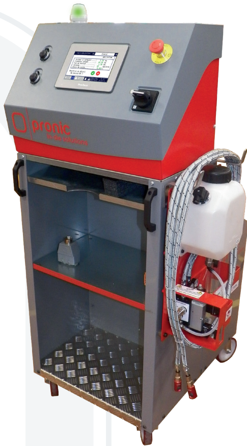
Controller mounted on a cart (optional) with a lubrication unit (optional)